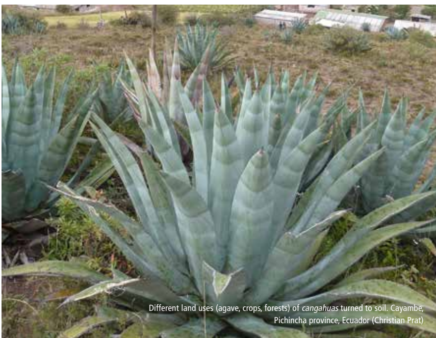
Different land uses (agave, crops, forests) of cangahuas turned to soil. Cayambe, Pichincha province, Ecuador (Christian Prat)

Through this method, after three to five years, from 40 to 90 Mg C ha -1 of carbon can be captured as soil organic matter, ten times more than found in European soils. In the context of global warming, this high potential of carbon capture provides an additional environmental service. At the same time, it also makes additional land available for agriculture, which prevents farmers from expanding to higher-level páramos seeking land for cultivation. Finally, it also avoids liberation of carbon dioxide (CO 2 ) thus reducing greenhouse gas emissions.