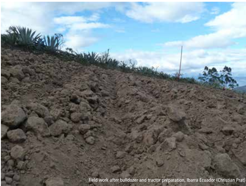
Field work after bulldozer and tractor preparation, Ibarra Ecuador (Christian Prat)

All these strategies focus on participative works to offer opportunities to small farmers to produce highly profitable crops, helping them to emerge from poverty. This will allow peasants (including their children) to remain farmers, instead of migrating to the cities, where they will join the legions of unemployed. Creating new spaces of productive and living soils from volcanic hardpans located in the foothills of the Andes has changed the look from deserted landscapes into fertile fields, avoiding further environmental destruction, and giving small farmers and their children new opportunities to live quite well from their production.